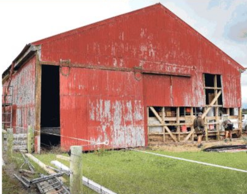
New life . . . Work continues on the almost 150-year-old former railway goods shed at Springbank.