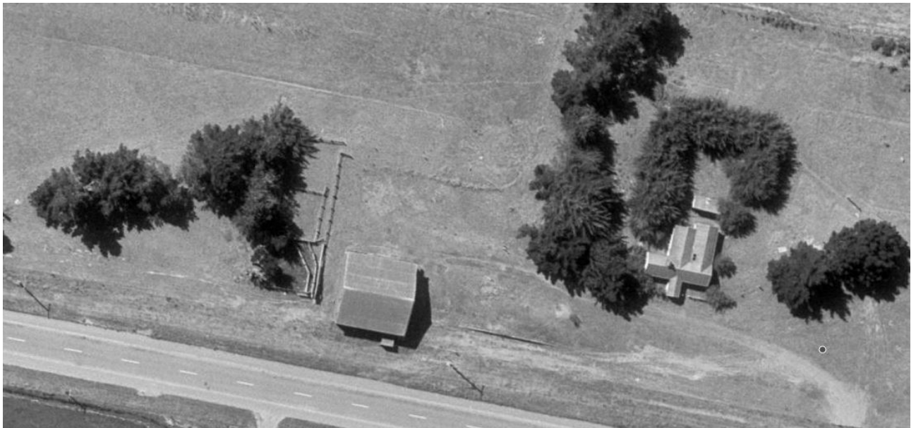
Aerial view of above, 1965-69. WDC.