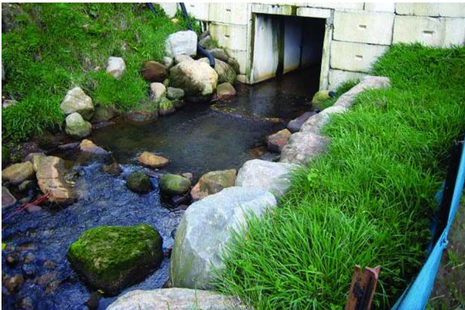
Figure 2: A rock ramp constructed to enable fish passage through a culvert by creating a pool downstream.