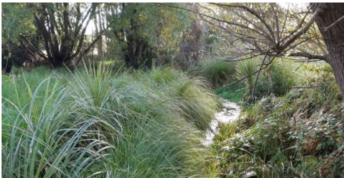
Figure 3: Existing native planting along the South Brook beside the Townsend Fields Stormwater Management Area (April 2022)