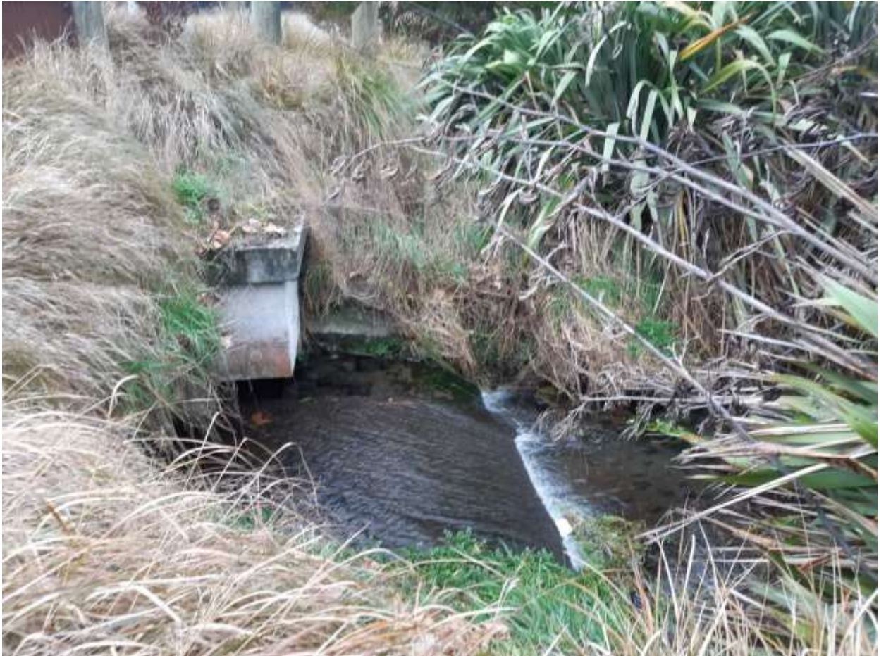
Figure 1: Likely partial fish passage barrier on a North Brook tributary – Corner of Cotter Lane and Northbrook Road