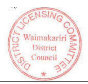
Chairperson WAIMAKARIRI DISTRICT LICENSING COMMITTEE

The renewed certificate can be issued immediately.