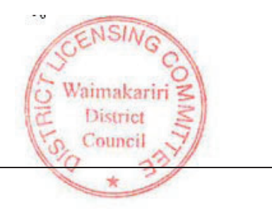
Chairman Waimakariri District Licensing Committee