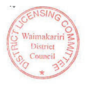
Chairperson WAIMAKARIRI DISTRICT LICENSING COMMITTEE

The renewed certificate can be issued immediately.