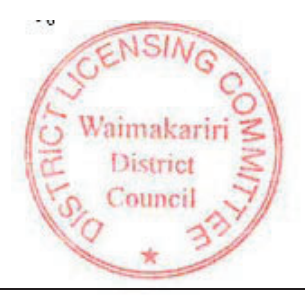
Chairperson WAIMAKARIRI DISTRICT LICENSING COMMITTEE

The renewed certificate can be issued immediately.