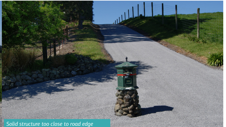
Solid structure too close to road edge