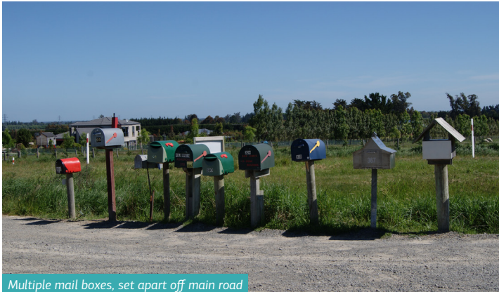
Multiple mail boxes, set apart off main road