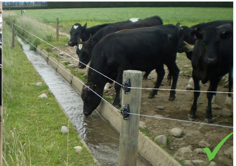
Stock using a good drinking bay