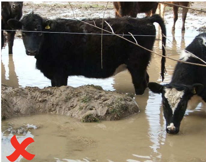
Stock polluting a water race

Water races can become polluted from stock and other farming activities. Appropriate stock access improves water quality for your stock, downstream water users, and freshwater biodiversity.