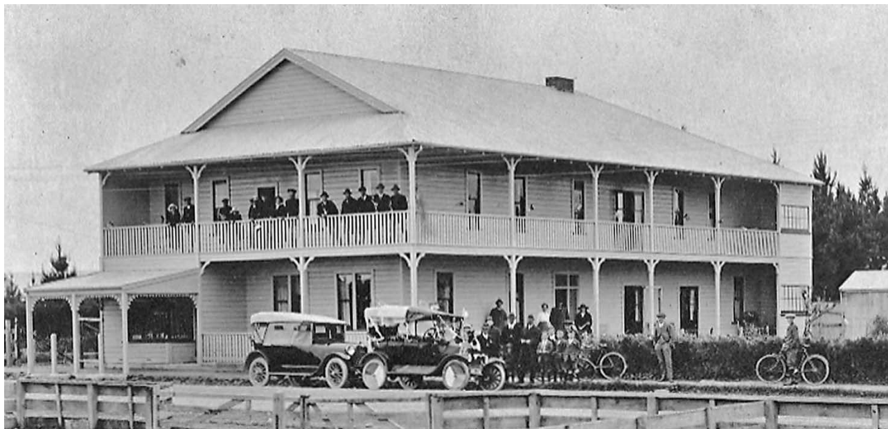
Undated photograph of the 'Reynox'.