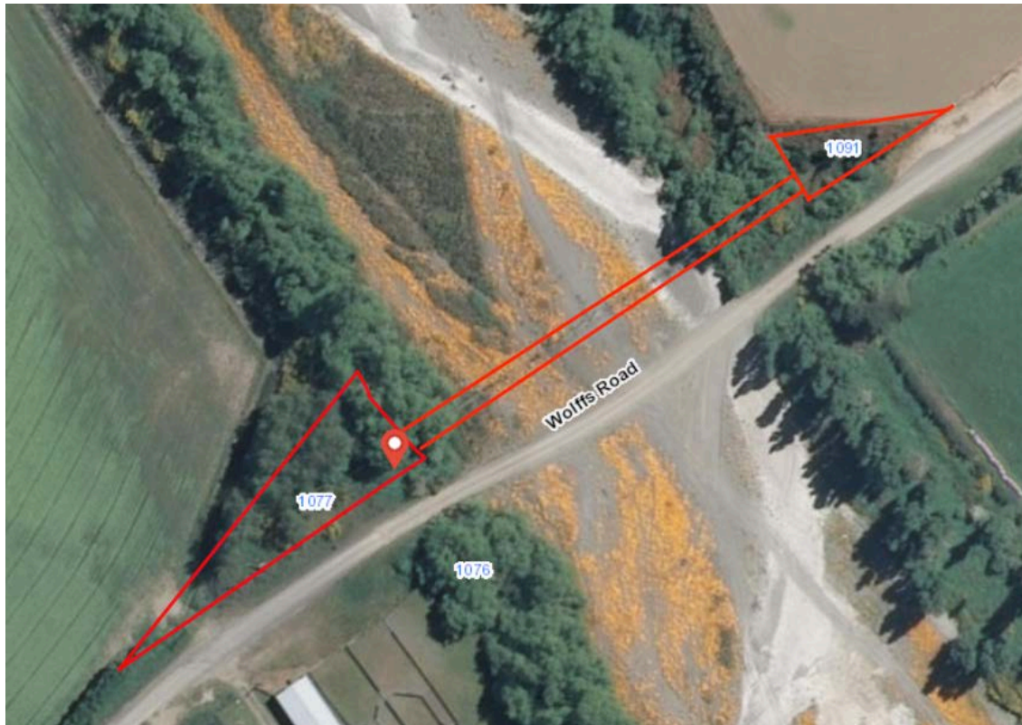
Extent of scheduling, encompassing the bridge and the land parcels on which its approaches are located, Wolffs Road/Eyre River, Horrellville.