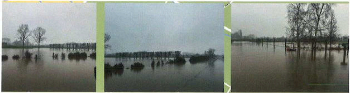
Figure 12 properties Silverstream end of Ohoka