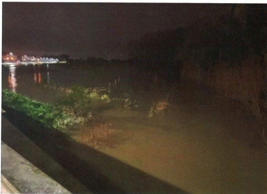
Figure 17 Ohoka road/Mill road intersection