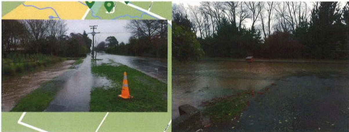
Figure 9 Mill road