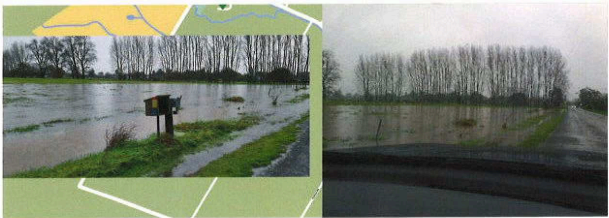
Figure 2 Whites road heading north, development site on left