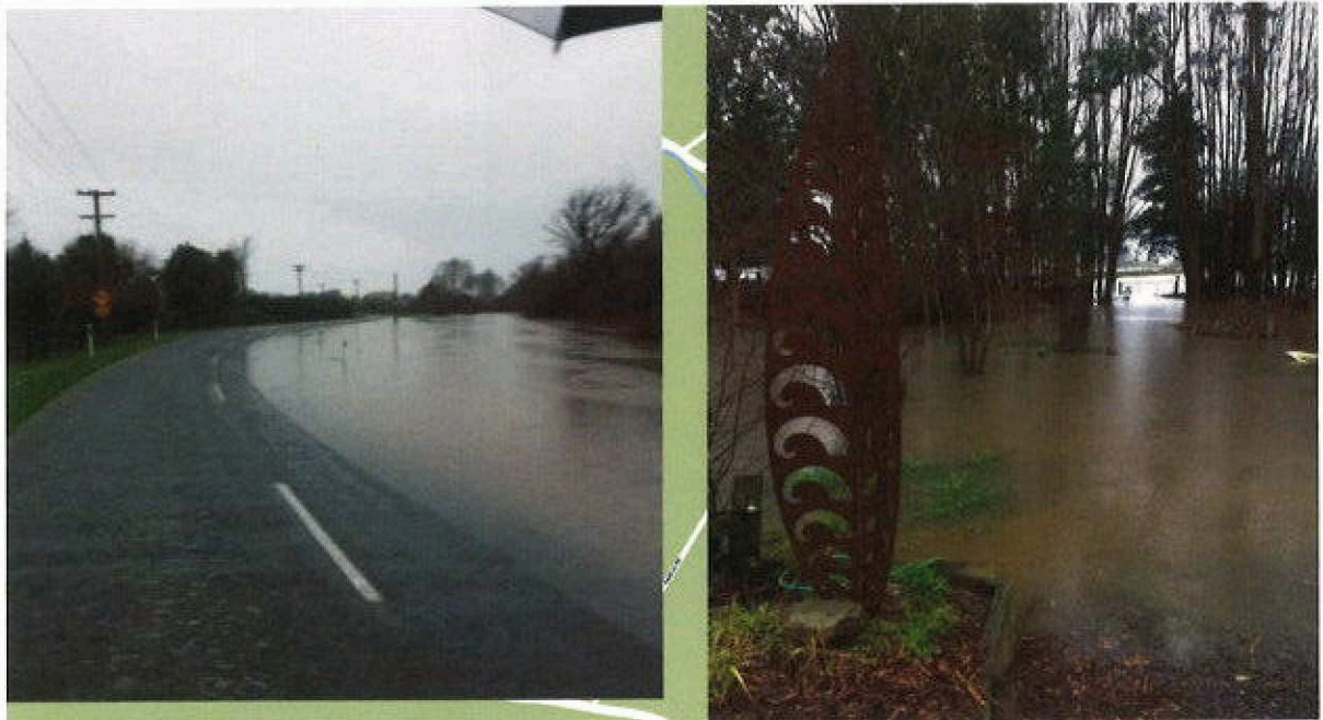
Figure 11 Mill road further downstream past Christmas RD