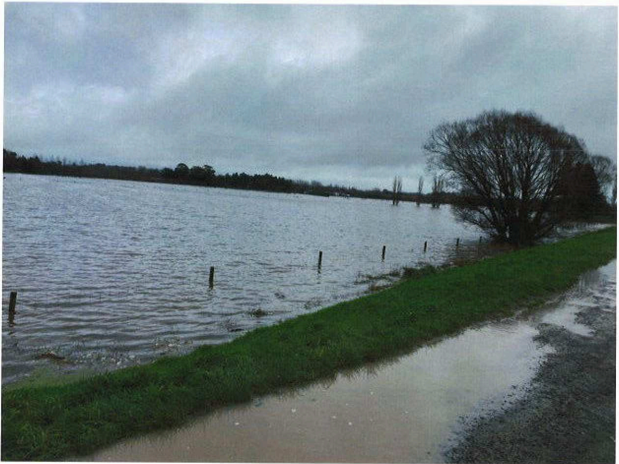
Figure 16 Thredelds Rd by Cust main drain