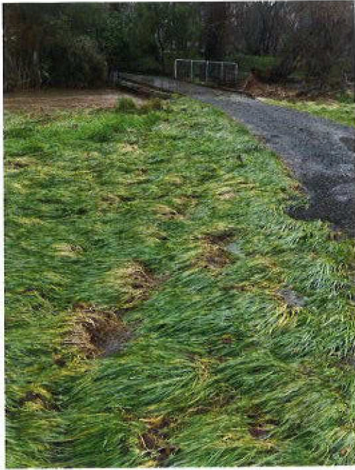
Figure 14 water receded Mill/Jacksons