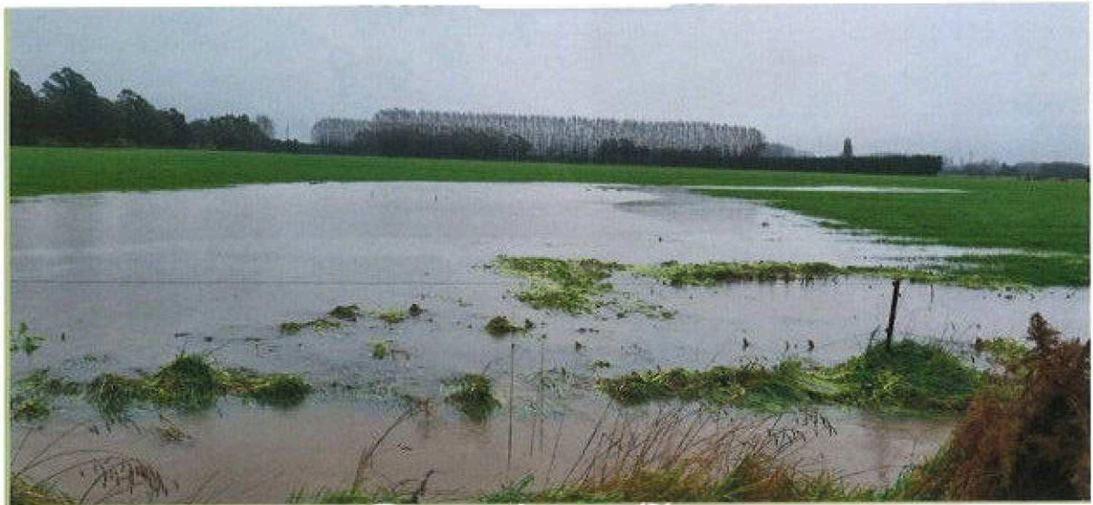
Figure 1 Whites Road looking onto site