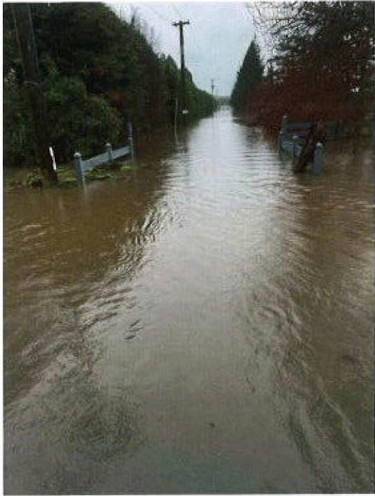
Figure 10 Threkelds Road Driveway