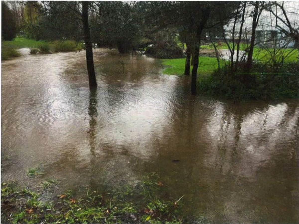
Figure 7 along Ohoka Stream Walkway north of development site