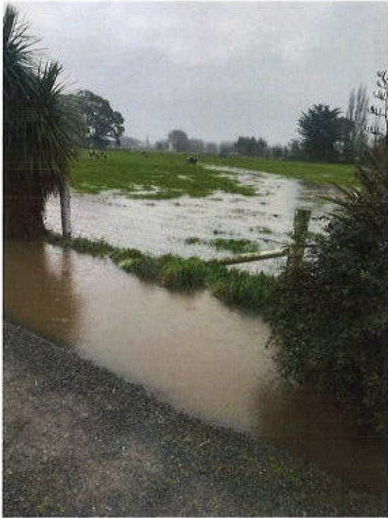
Figure 3 Development site- not a stream, just flow path