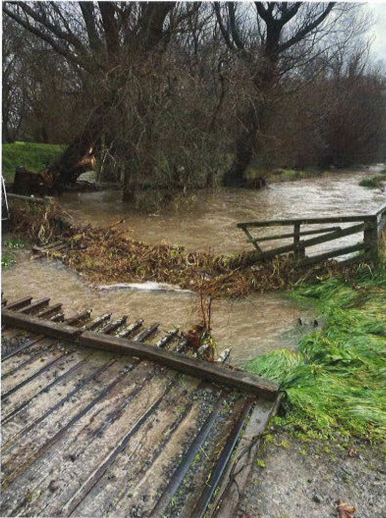
Figure 13 Cottrell residence corner mill and jacksons