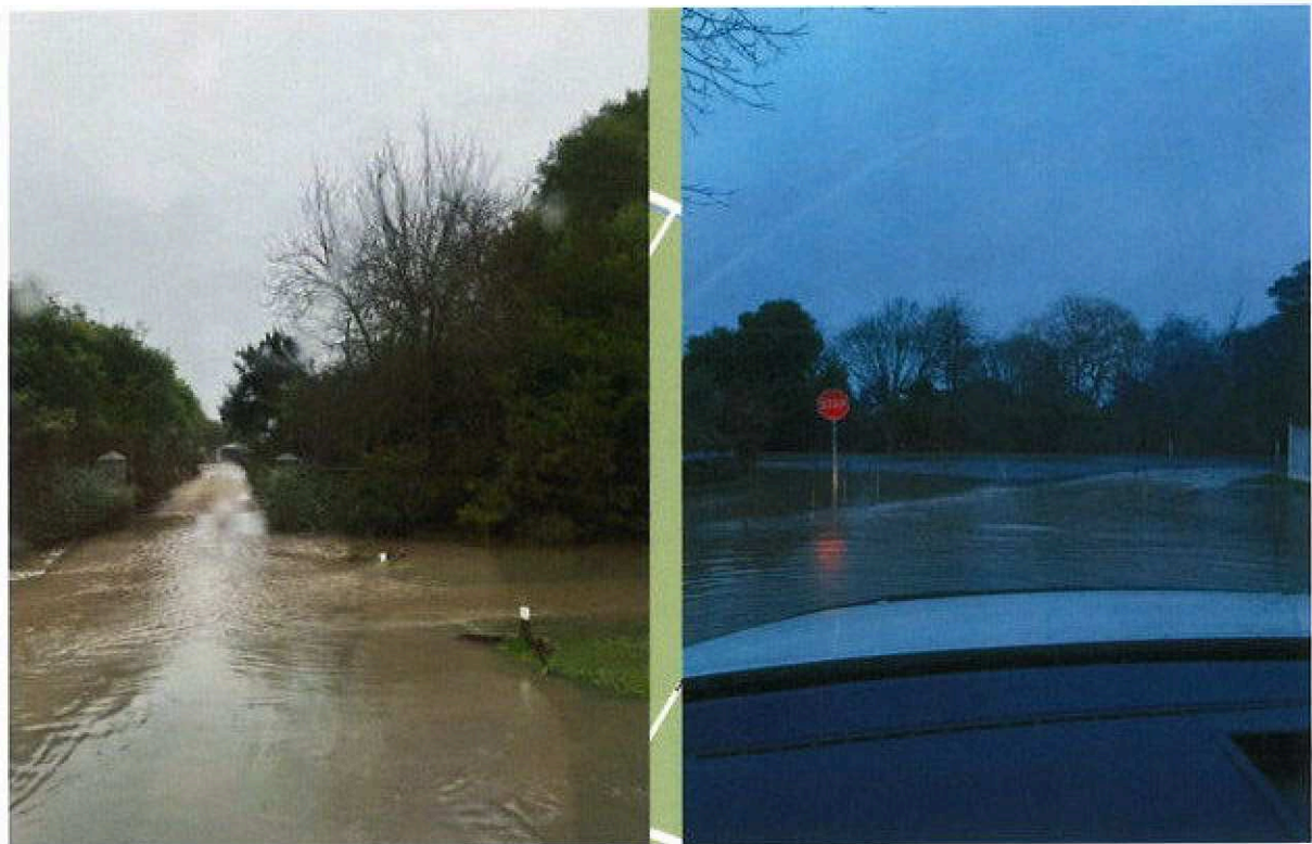
Figure 6 Mill road driveway east of Domain