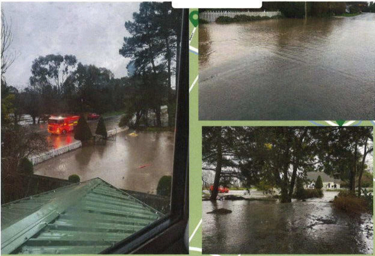
Figure 4 whites road opposite the Domain, north east corner of proposed development