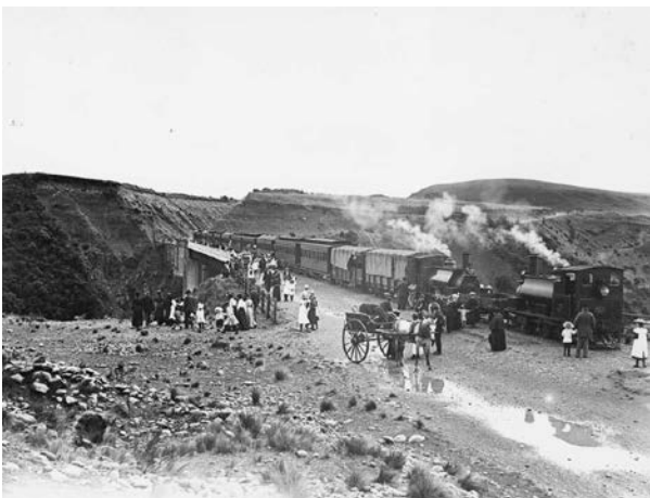
A train stopping on the bridge to allow a sightseeing party to disembark. 1890s. PAColl-7581-74, Alexander Turnbull Library, Wellington.