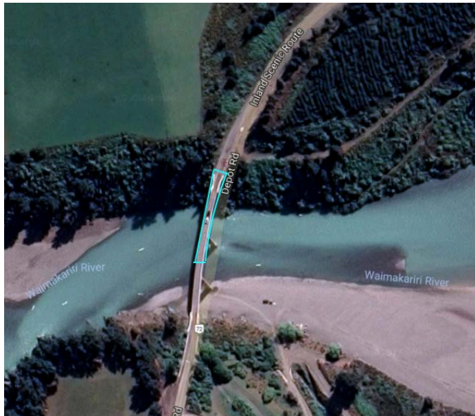
Extent of scheduling, limited to WDC portion of bridge, Waimakariri Gorge Bridge, Depot Road, Burnt Hill, Oxford.